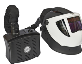
DW7000XL comes with battery powered air respirator.